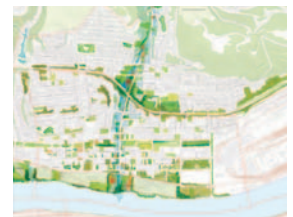
Mapping Braddock's Possible Futures: Possible Green Infrastructure