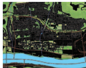
Mapping Braddock's Possible Futures: An emergent green network