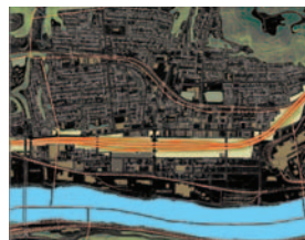
Mapping Braddock's Possible Futures: The proposed Mon-Fayette Toll Road