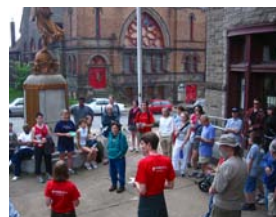
Community Dialogue: Urban Hike