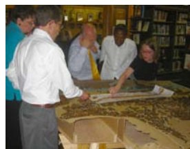
Community Dialogue: Meeting with elected officials